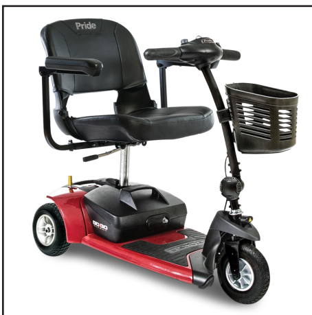
Go-Go ® Ultra X 3-Wheel