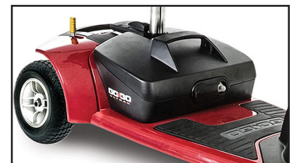
Drop-in Battery Box