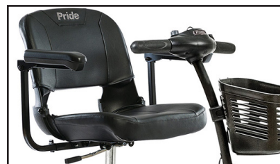
Comfortable Swivel Seat