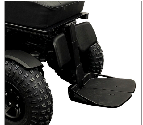
Centre Mount or Swing Away Leg Rests