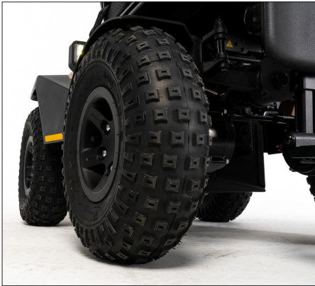
Automotive-Grade (SRS) Suspension