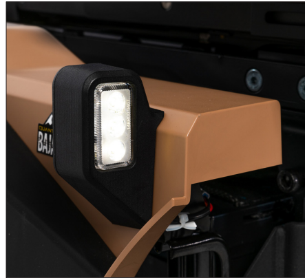
LED Lighting Package